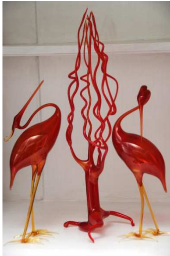
Daniel Swarovski 1892